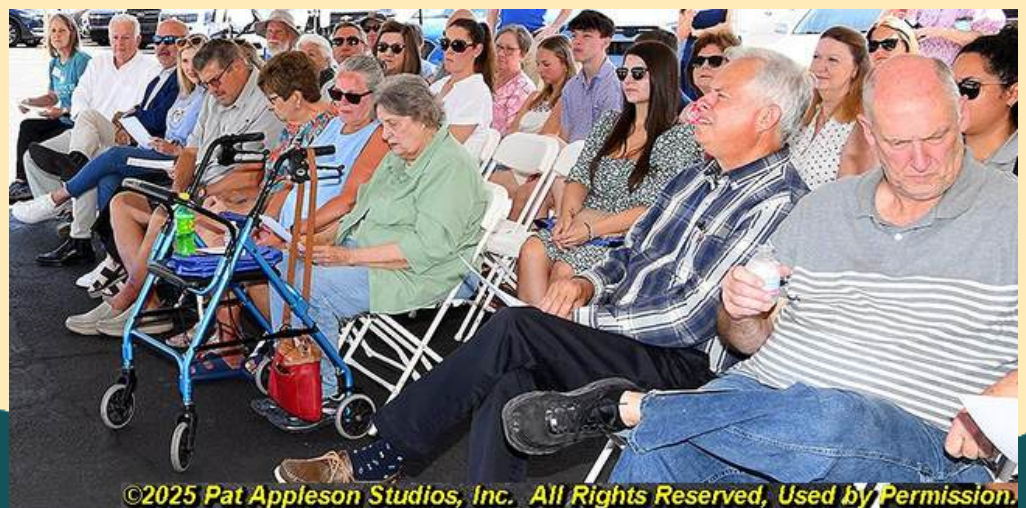
June 20 Ribbon Cutting Attendees