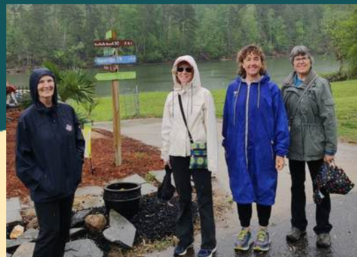
Rhodhiss, Drexel, Hildebran, Rutherford College, Glen Alpine

BRTA hosted Trail Town Tours in five Burke towns, inviting participants from across Burke County and the region to experience each community through a fresh lens. Tours featured insights from mayors and town managers on local history, amenities, and future plans, followed by guided walks through downtowns, parks, and current or planned Burke River Trail routes. By pairing local storytelling with on-the-ground exploration—and lunch from local restaurants—the tours helped spread awareness, spark visitation, and showcase each town as a destination . Free and open to all, Trail Town Tours strengthened regional understanding and encouraged people to explore beyond their own hometowns .