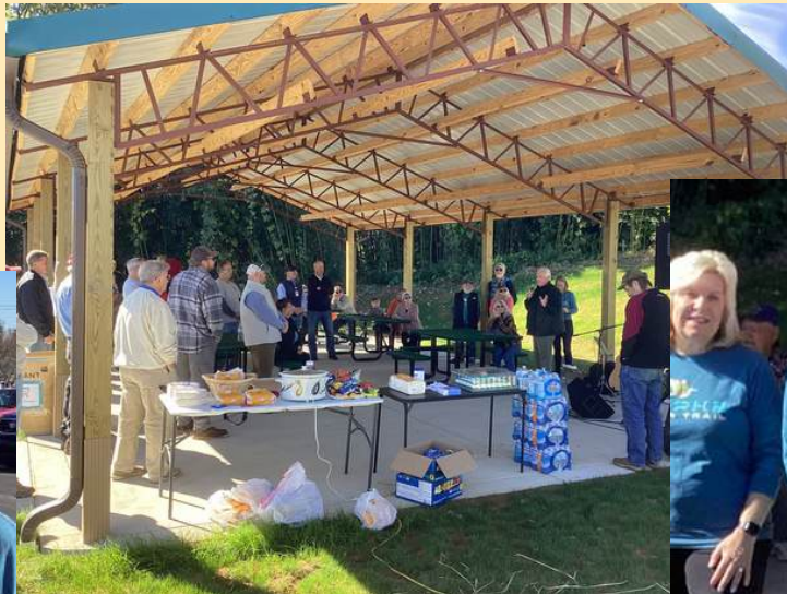
Ribbon Cutting - Free Community Picnic with Live Music