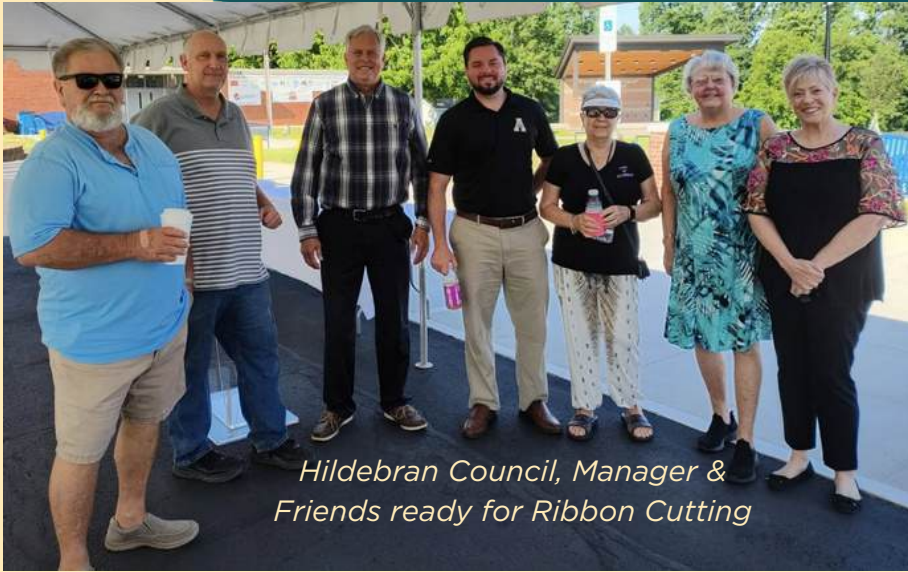
Hildebran Council, Manager & Friends ready for Ribbon Cutting